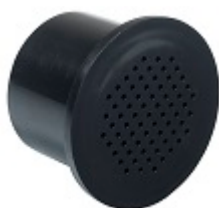
Active charcoal filter - FILTRE1 It's recommended to change it every years.

Free wine cellar management application. Access a virtual representation of your wine cellar and a detailed inventory of its contents.