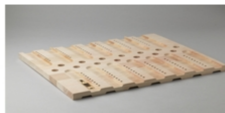
Optional COLLECTOR 1/62 shelf